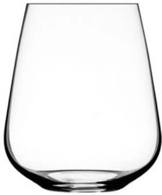
Vinophil Barolo 32 (VP21) h117mm c615ml 21.64oz