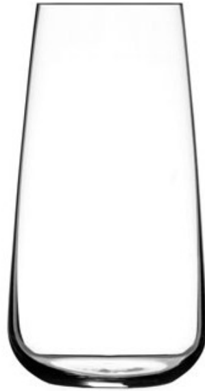
Vinohil Juice/Beer (VP09) h135 c380ml 13.37oz