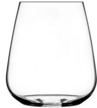
Vinocap Chardonnay 21 (VP09) h99mm c390ml 13.73oz