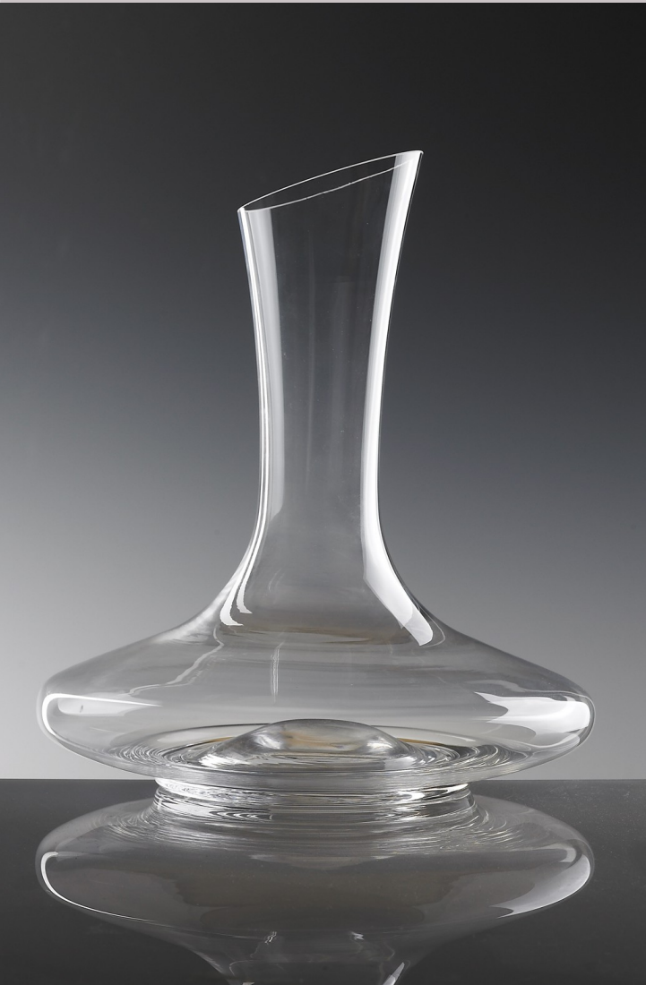
Inspiration Decanter Diagonal (31) h259mm c1500ml