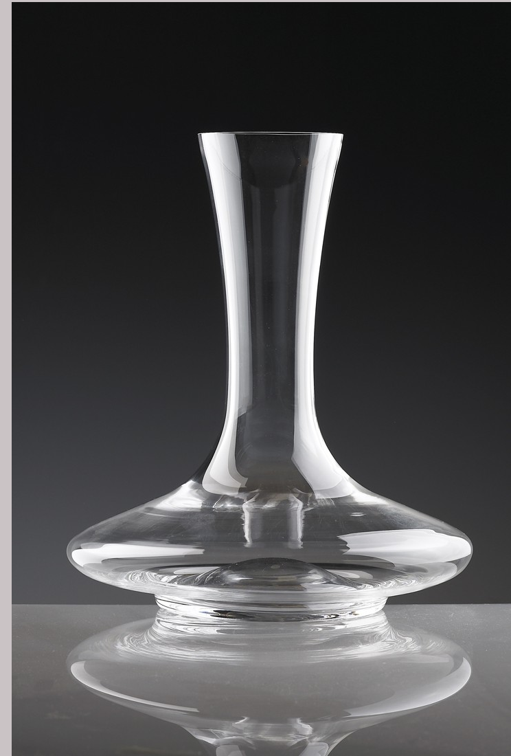
Inspiration Decanter Straight (30) h264mm c1500ml