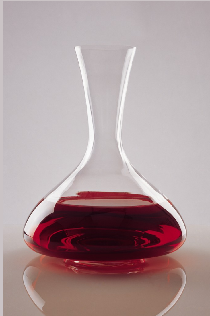
Gala Decanter (1642) h220mm c1500ml